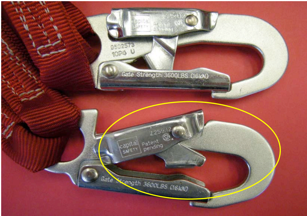
Photo: Lower hook: the hook model locking mechanism to be removed got jammed after normal handling.

Observed characteristic: The hook of the model to be removed has a tip that is not of the same length as the gate, which provides grip on the gate and allows it to open relatively easily through rotation in the harness ring.