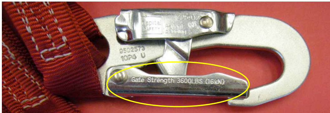
Model to be removed (3600 lbs. gate)

We are asking you to verify the hook model on all lanyards of your departments. If you find this type of hook, remove the lanyard until further notice.